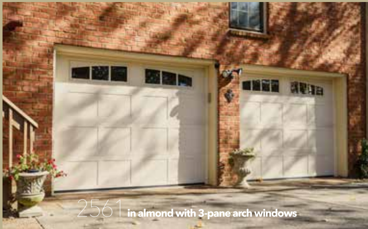
2561 in almond with 3-pane arch windows