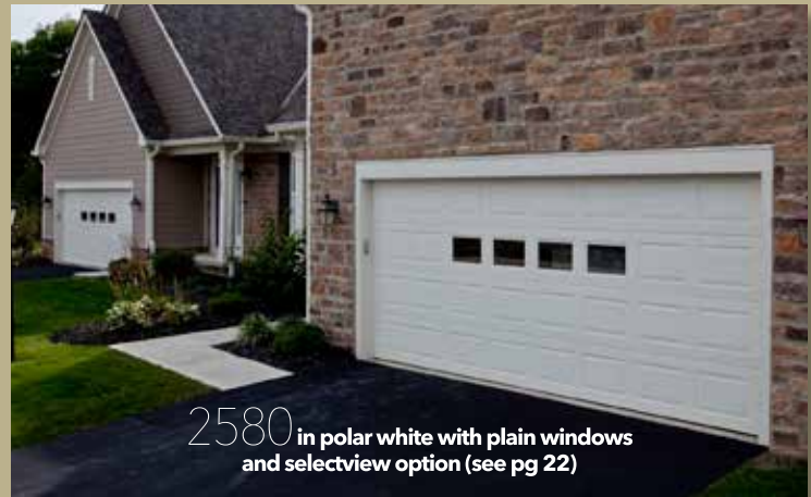
2580 in polar white with plain windows and selectview option (see pg 22)