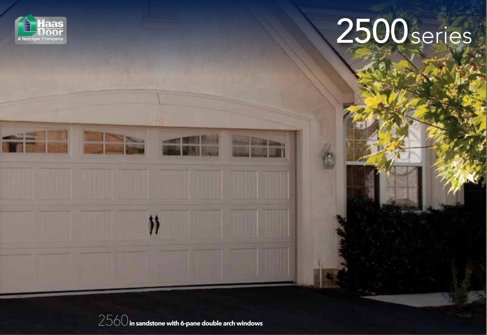
2560 in sandstone with 6-pane double arch windows