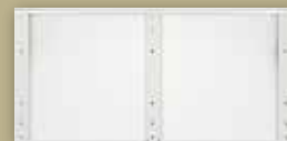
Insulated Laminate Back (L) - inside view

* L indicates energy efficient insulated laminate back option