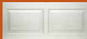
Raised Standard Panel Model 780

Ranch Windows p24 & 26 Model 767 ◊ Carriage Windows p24 & 25 Model 787 ◊ Standard Windows p24 & 27