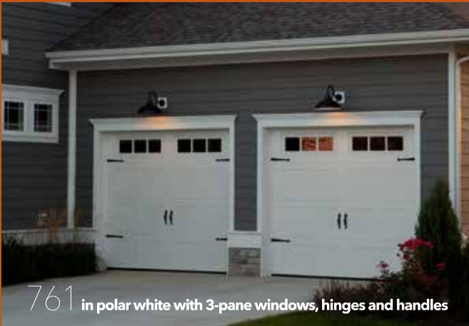
761 in polar white with 3-pane windows, hinges and handles

764 in sandstone with 3-pane windows, hinges and handles