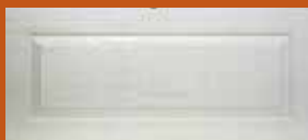
Raised Ranch Panel Model 770

(Not available in 24" sections) Carriage Windows p24 & 25 Model 773 (Not available in 24" sections) Ranch Windows p24 & 26