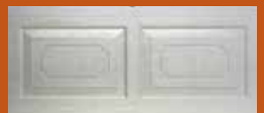
Raised Sculptured Panel Model 790

Standard Windows p24 & 27 Model 768 ◊ Carriage Windows p24 & 25 Model 778 ◊ Ranch Windows p24 & 26