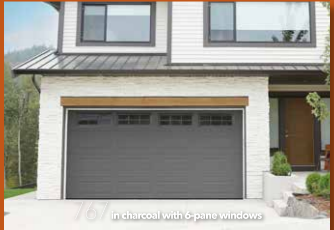
767 in charcoal with 6-pane windows